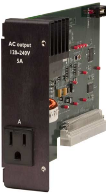
PTC420 AC output card

The PTC420 output card is a 120/240 VAC heater driver that delivers up to 5 A of current, and is intended to drive large heaters. Alternatively, the PTC430 DC output card delivers up to 50 VDC and 1 A of current for driving smaller heaters.