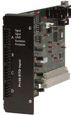
PTC321 Pt RTD card