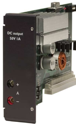
PTC430 DC output card