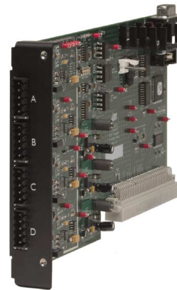
PTC322 Pt RTD card (single slot)

The PTC10 Programmable Temperature Controller has the flexibility to handle virtually any temperature control application. It's as useful in the research lab as it is in industry. The PTC10 is the right choice for all your temperature control experiments.