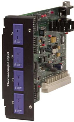
PTC330 Thermocouple card