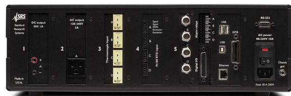
PTC10 rear panel